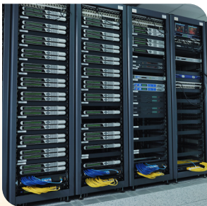
Hyperscale data centres