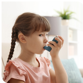
Personalised home healthcare